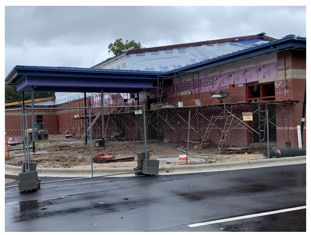
Entering the gym through the weight room I find an electrician installing conduit on the east wall.

The brickwork on the outside of the gym is almost complete and looks very good. The bricks across the east side of the gym have to go up about two more feet to the eave of the weight room roof. The east wall of the gym above that level will be beige stucco finish metal panels.