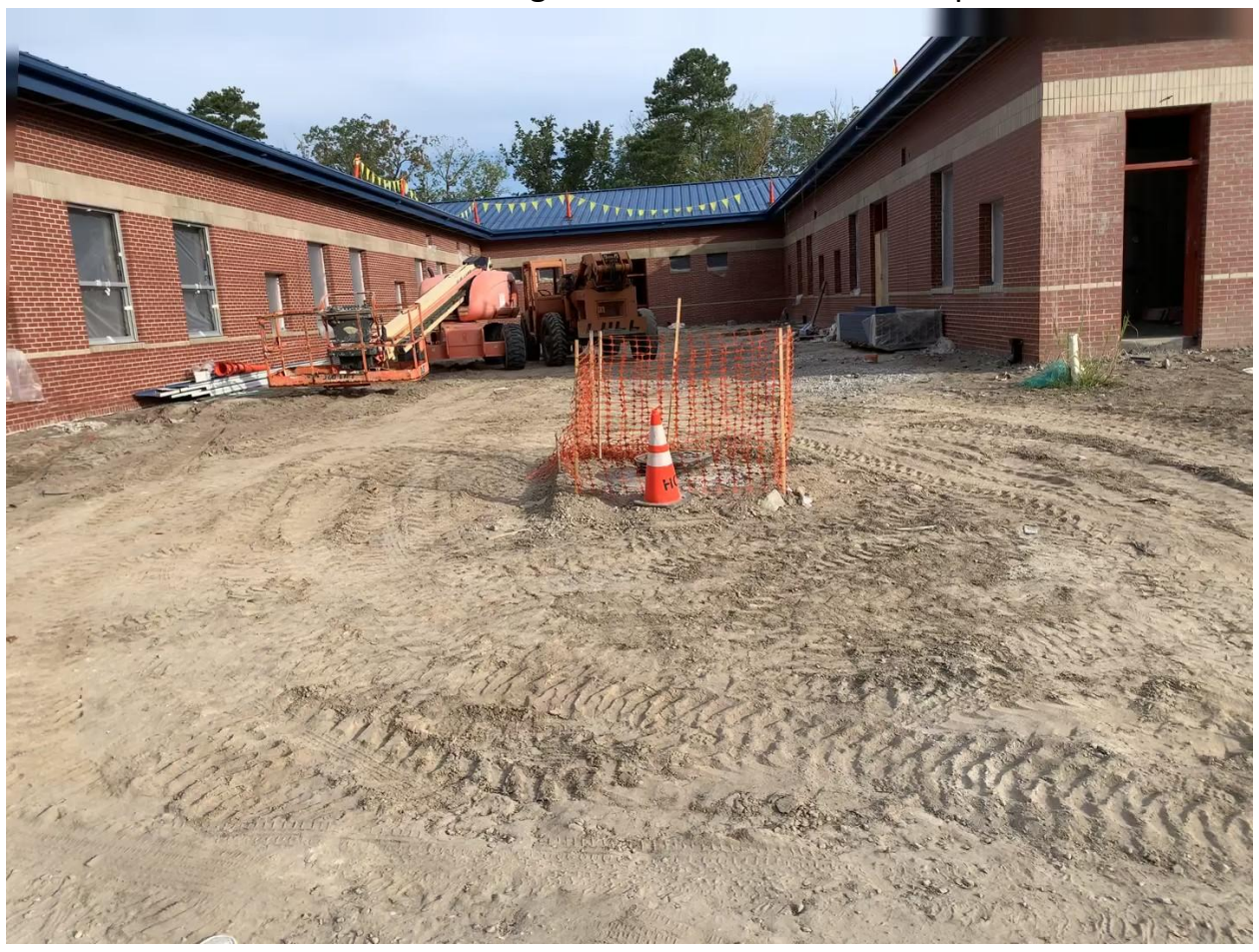
Housekeeping inside and out continues to be very well done. Drywall finishers

The outside at the back is looking much more like a finished product.