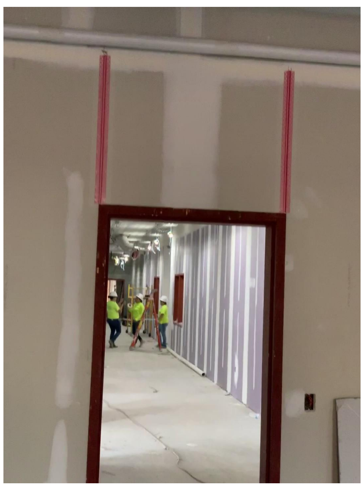
This is where the drawings call for the sheetrock to be grooved to keep cracks