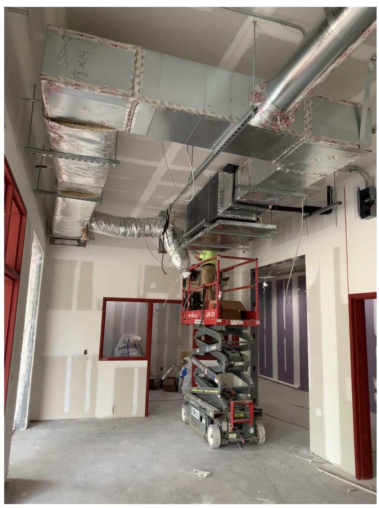
Work is taking place throughout the new construction but it takes a lot of looking